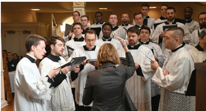
The schola cantorum adds beauty to the Holy Mass.

The patronal feast day celebrations continued Sunday, January 26 when 200 benefactors joined us for Mass and a luncheon. In honor of our patron saint, the seminarians prayed a novena to St. Francis de Sales for the intentions of our faithful supporters.