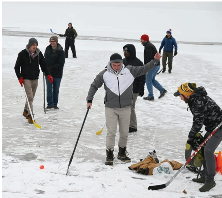
Lake Winnebago provides the ultimate outdoor rink for the seminarians.