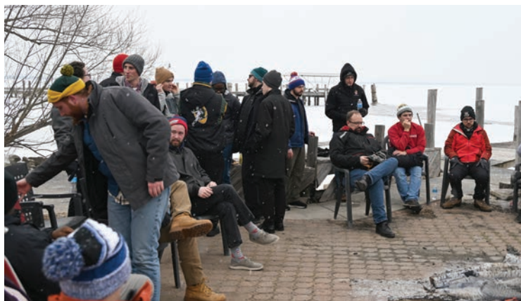
The fire was a welcome treat after hockey