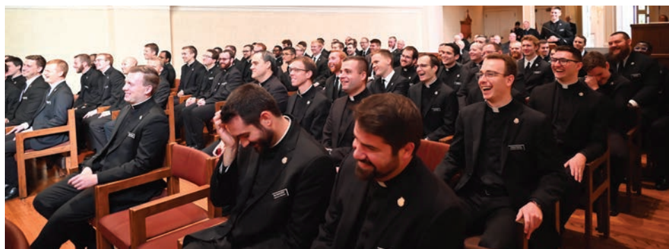
The seminarians enjoy the archbishop-designate's sense of humor.