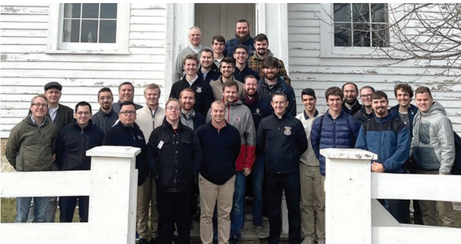
The Propaedeutic Stage seminarians pose outside of St. Peter's Church during a Catholic heritage excursion. The historic building was the first Cathedral in Milwaukee.