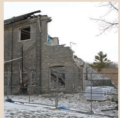
The building is carefully deconstructed, saving the Cream City bricks for use in the expansion project.