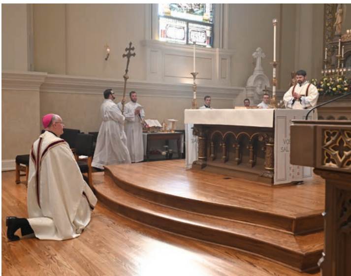
Archbishop Grob genuflects during the procession of his first Mass in Christ King Chapel.