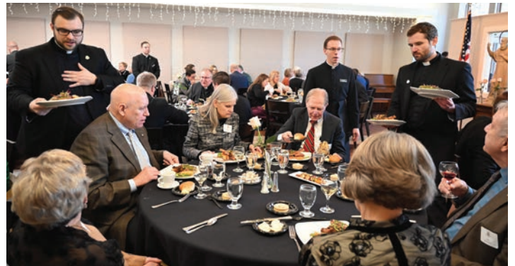
Benefactors are served by grateful seminarians.