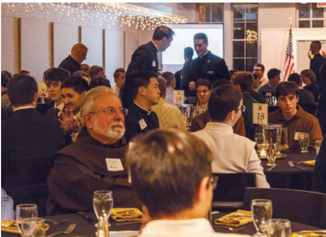
The annual vocation event is a great support to men discerning a call to the priesthood.