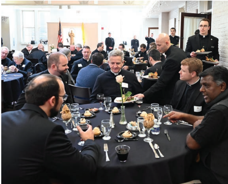
Seminarians serve an elegant lunch to the priests.