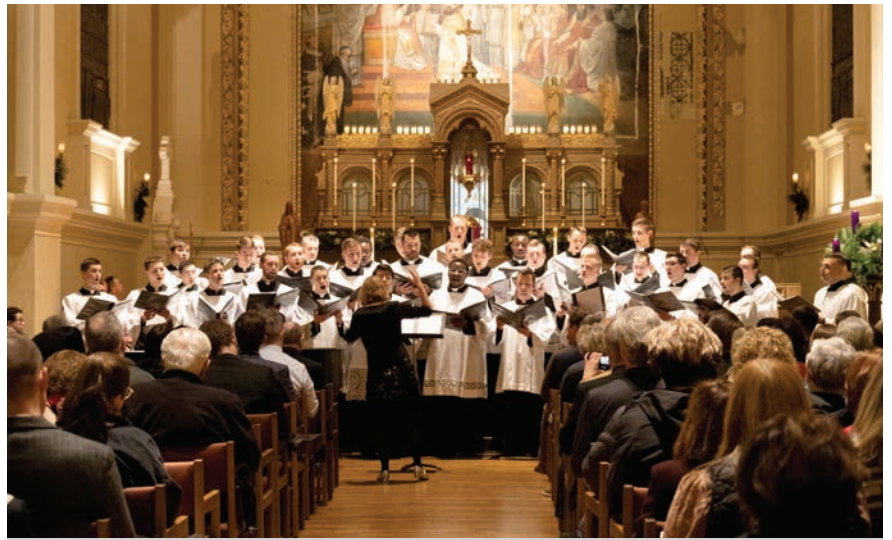
The Schola Cantorum enchants a full chapel of guests during the Festival of Lessons and Carols in December.