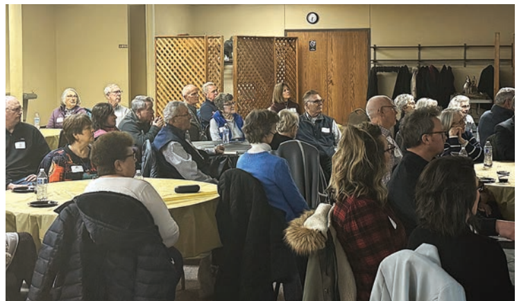
The reception at St. Clement Parish in Sheboygan is filled with people interested in supporting the Seminary.