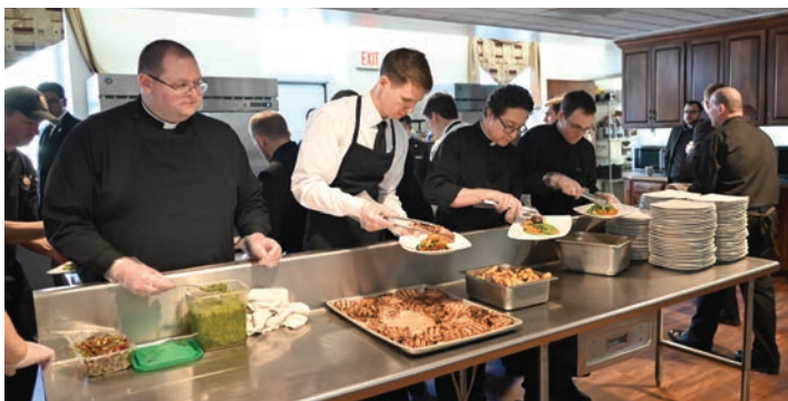
Seminarians carefully plate the food for our guests.