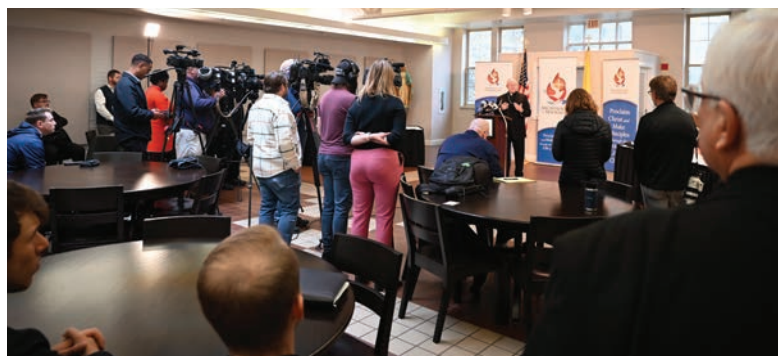
The newly appointed Grob speaks to the press from the Seminary Commons.