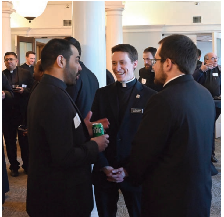
Seminarians and priests enjoy catching up during the reception.