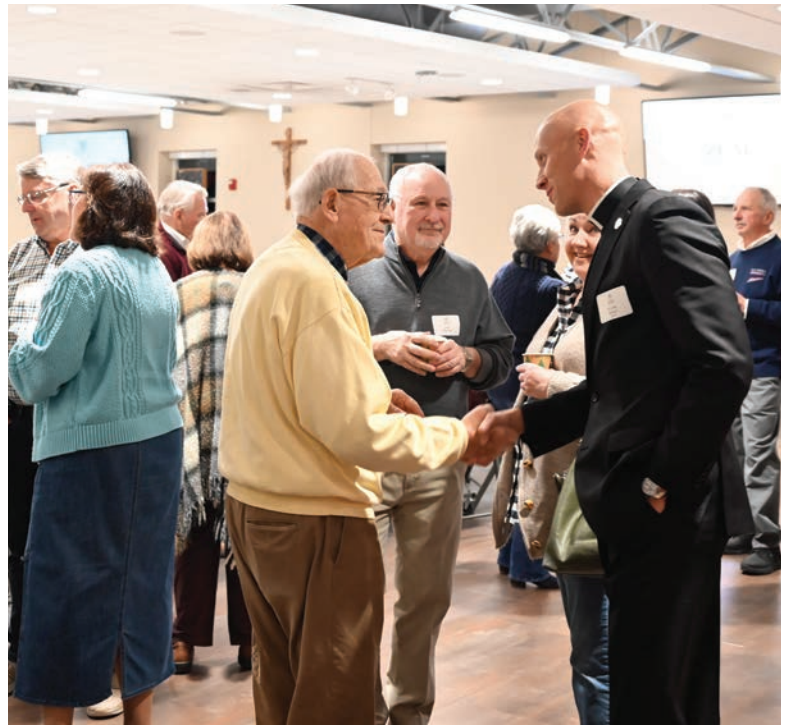
Parishioners begin to gather at the reception hosted by Lumen Christi Parish in Mequon.