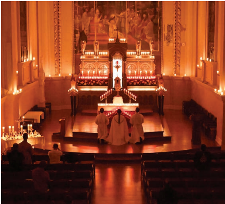
The all-night vigil for the Solemnity of All Saints is breathtakingly beautiful.