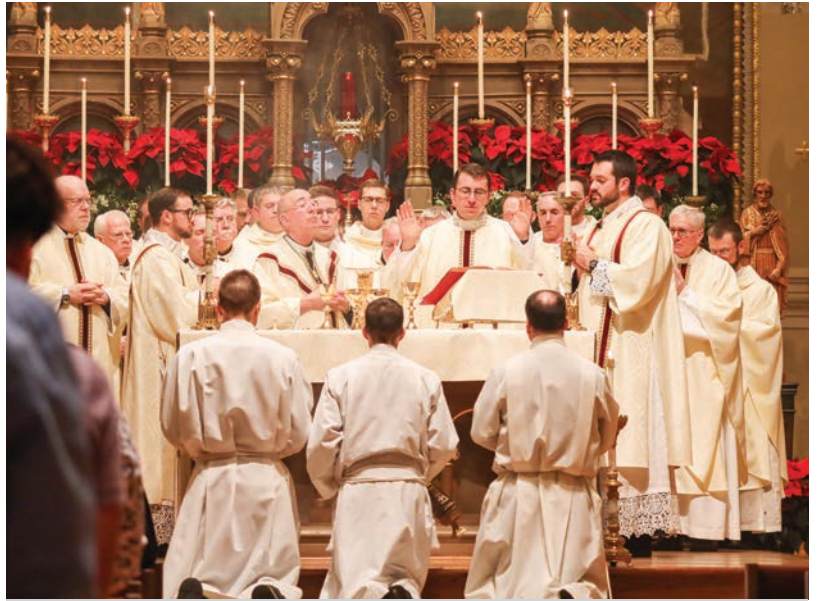
Dozens of priests concelebrate the Mass on the feast of St. John the Evangelist.