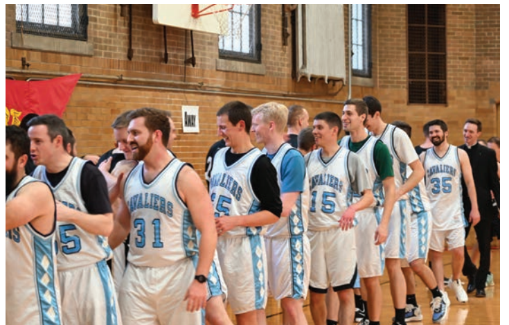
The priests are good sports after being soundly beaten by the Shoremen 64-27.