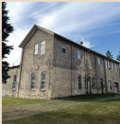
Commonly referred to as the old laundry building, it is thought to have been the first building on the campus.