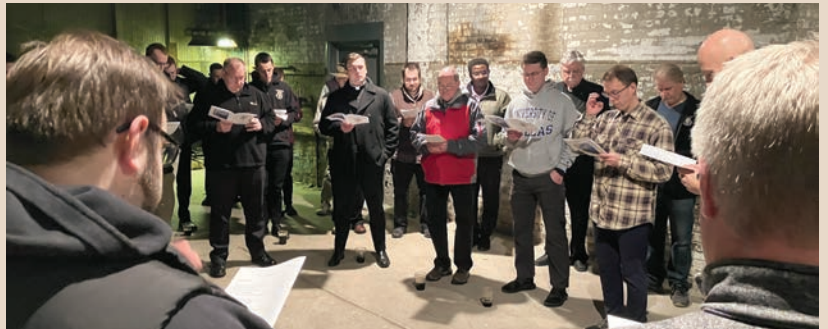
The Seminary community gathers in the building for a farewell blessing and celebration before the former coach house is taken down.

We may not have been able to save the building, but we did save the Cream City bricks! The building was taken down carefully, and the bricks were stored for use when the expansion of Henni Hall begins.