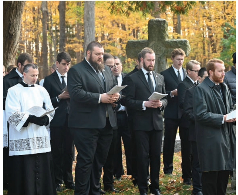
Seminarians pray in our cemetery for those who have gone before us on All Souls' Day.